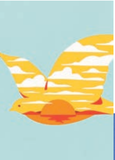
Spirituality and Inner Life $302,500