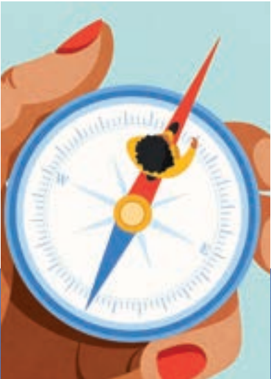
Authentic Leadership $1,056,556