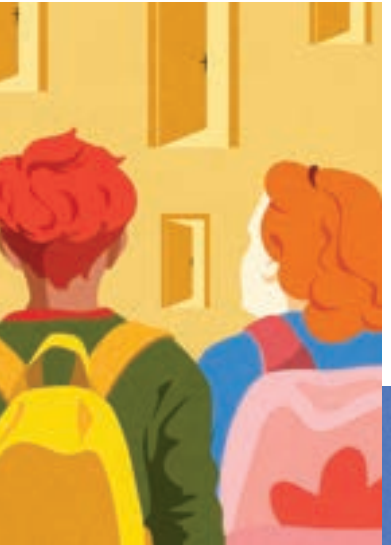
Youth Development $247,500