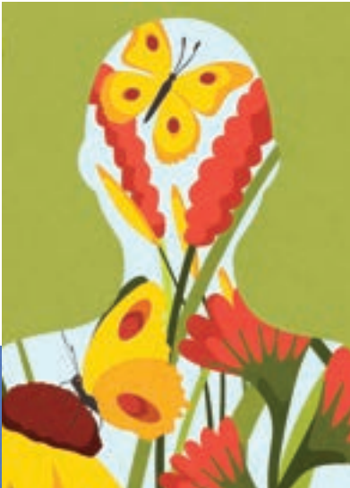
Whole-Person Health and Wellbeing $1,740,117