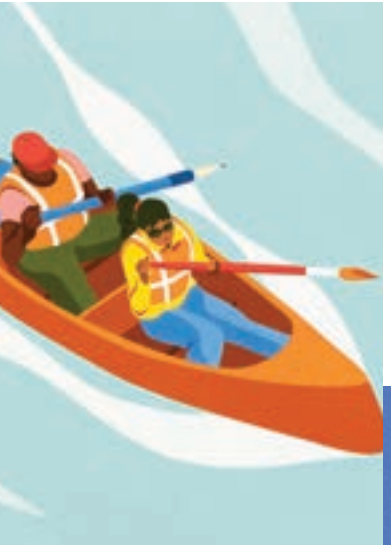
Next Generation Fund $275,000