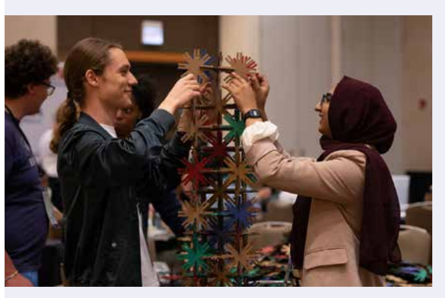
Student leaders work together during an activity at the Interfaith Leadership Summit, August 2022.

Interfaith America works to demonstrate the relevance and actualize the potential of religious diversity in civic life. Interfaith America focuses its work in the areas of higher education, healthcare, public policy, racial equity, and technology illuminating and enabling the positive engagement of religious diversity within those spaces. Taken together, the work of Interfaith America brings people together across differences in religious and fundamental conviction, advancing common life and democratic vitality.