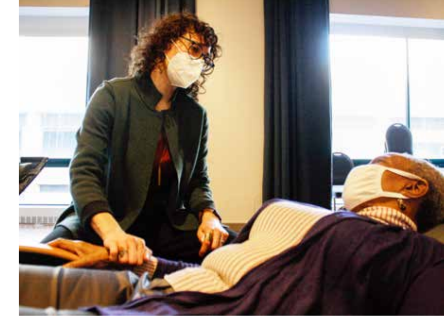
Free community acupuncture at Douglas Dayton YMCA George Wellbeing Center during the height of the COVID-19 pandemic in downtown Minneapolis.

country, the understanding of what true, full health means is now clear and accepted. So, even as we focus on what's next, it is worth pausing to appreciate just how much has been achieved in the field over the last