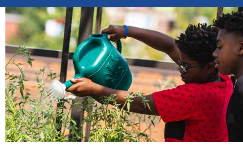
Watering the vegetable garden at the greenhouse at Harold Mezile North Community YMCA in North Minneapolis.