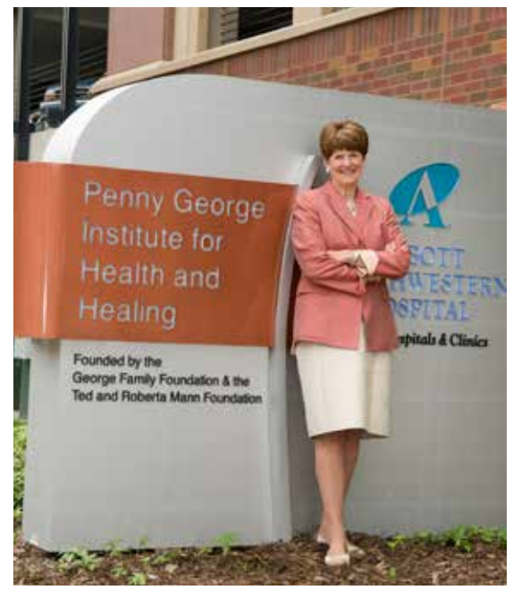
In 2008, the Institute for Health and Healing at Abbott Northwestern was renamed the Penny George Institute for Health and Healing.