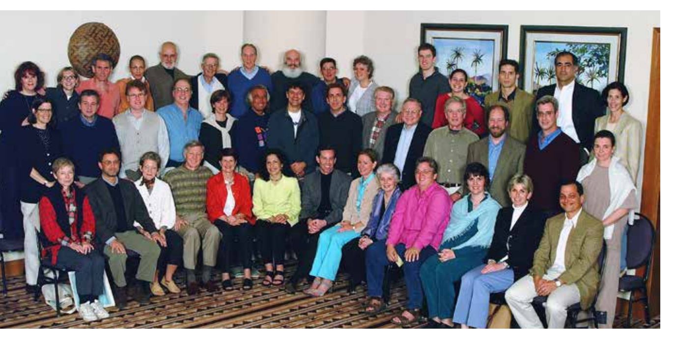
The initial "Conversation at Miraval" in April 2001, when philanthropists and physicians gathered to strategize what was most needed to catalyze the field of Integrative Medicine. This meeting ultimately led to the founding of The Bravewell Collaborative in 2002.