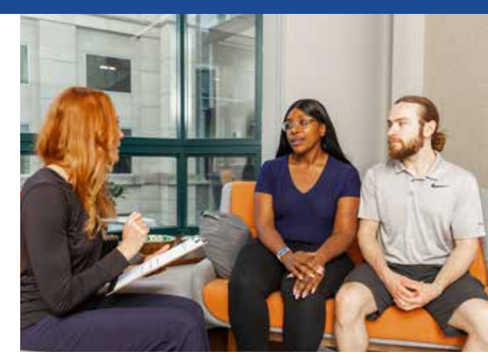
An integrative health and wellbeing coaching session at Douglas Dayton YMCA George Wellbeing Center in downtown Minneapolis.

The Y believes strongly that, when wellbeing is positioned as a right and not a luxury, people start believing that their choices matter and that their unique journey has meaning. George Wellbeing will seamlessly blend practices from conventional and holistic models to create a comprehensive whole-person wellbeing model.