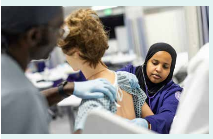
Master's level nursing students practice techniques in the Summit Classroom Building Skills Lab at the University of St. Thomas.

Highlights of the multifaceted initiative include: creation of the George Family Innovation Fund to support communityengaged projects centered around systems change through whole-person care; integrative health training courses for both students and working healthcare professionals; and a signature annual convening for community partners, thought leaders, scholars, and practitioners to fast-track ideas that shift the paradigm to whole-person care.