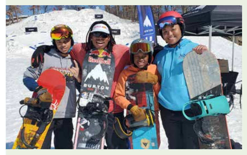
The Minneapolis Parks Foundation helped support this snowboarding event at Theodore Wirth Regional Park in Minneapolis, hosted by Melanin in Motion and The Loppet Foundation.

We provide core mission support to the Minneapolis Parks Foundation to help them invest in community-driven projects that nurture stewardship and enjoyment of Minneapolis parks, such as Afro Yoga, free swimming lessons, and Slow Roll community bike rides led by the Cultural Wellness Center. They also engage in community design of future park improvements, revitalizing and activating public spaces in innovative ways. By aligning philanthropic investment and community vision, they aim to transform human lives through the parks that help make Minneapolis a thriving community.