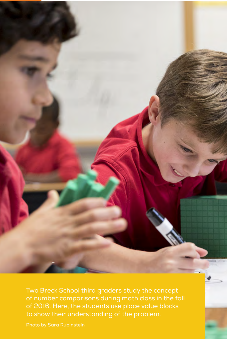
Two Breck School third graders study the concept of number comparisons during math class in the fall of 2016. Here, the students use place value blocks to show their understanding of the problem.