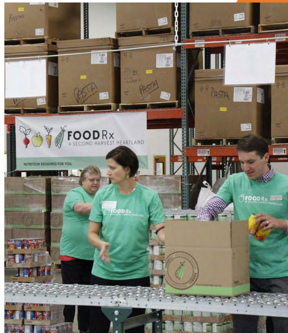
Volunteers pack CHRONIC NEEDS boxes at the launch of FOODRx. Boxes are delivered to Second Harvest partners for distribution to patients.

The George Family Foundation is pleased to be able to help Second Harvest Heartland continue this pilot project. In addition, we are grateful to the other funders who have joined us in this effort.