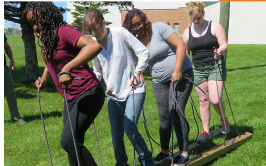
Planned Parenthood Reach One Teach One members in Duluth practice a teambuilding exercise at a low ropes course. Reach One Teach One is a peer education program that trains young people on reproductive health topics and leadership skills. As peer educators, students provide accurate information within their peer groups, and become trusted "go-to" resources in their schools and communities, ultimately reaching hundreds of people each year.