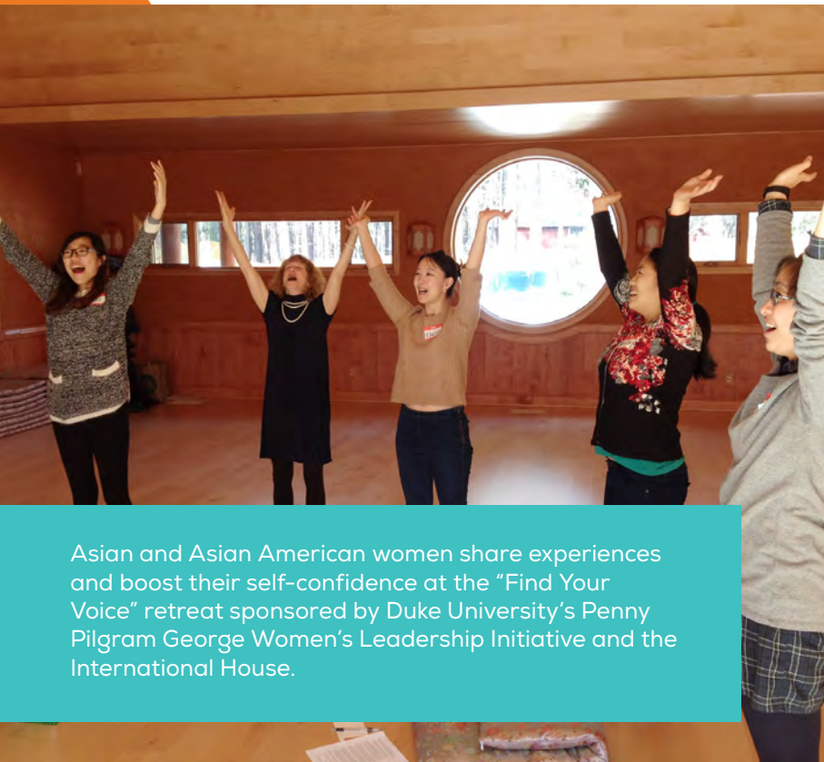
Asian and Asian American women share experiences and boost their self-confidence at the “Find Your Voice” retreat sponsored by Duke University’s Penny Pilgram George Women’s Leadership Initiative and the International House.