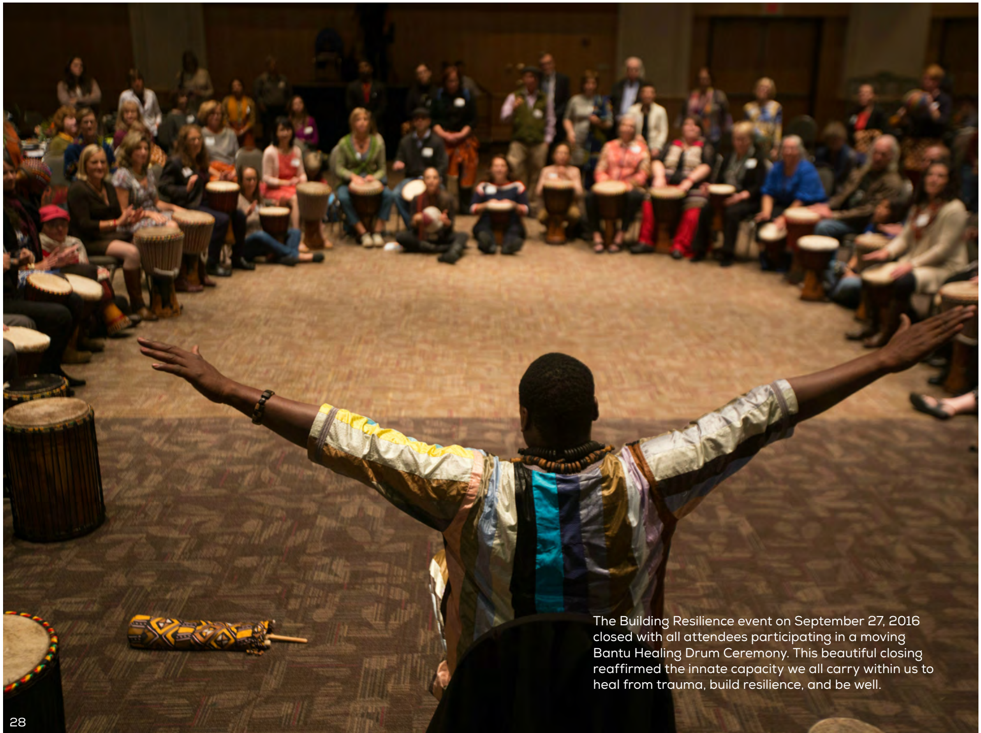
The Building Resilience event on September 27, 2016 closed with all attendees participating in a moving Bantu Healing Drum Ceremony. This beautiful closing reaffirmed the innate capacity we all carry within us to heal from trauma, build resilience, and be well.